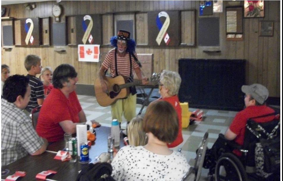
Chester the Clown entertains diners at Branch 36's Canada Day Good Neighbour BBQ.