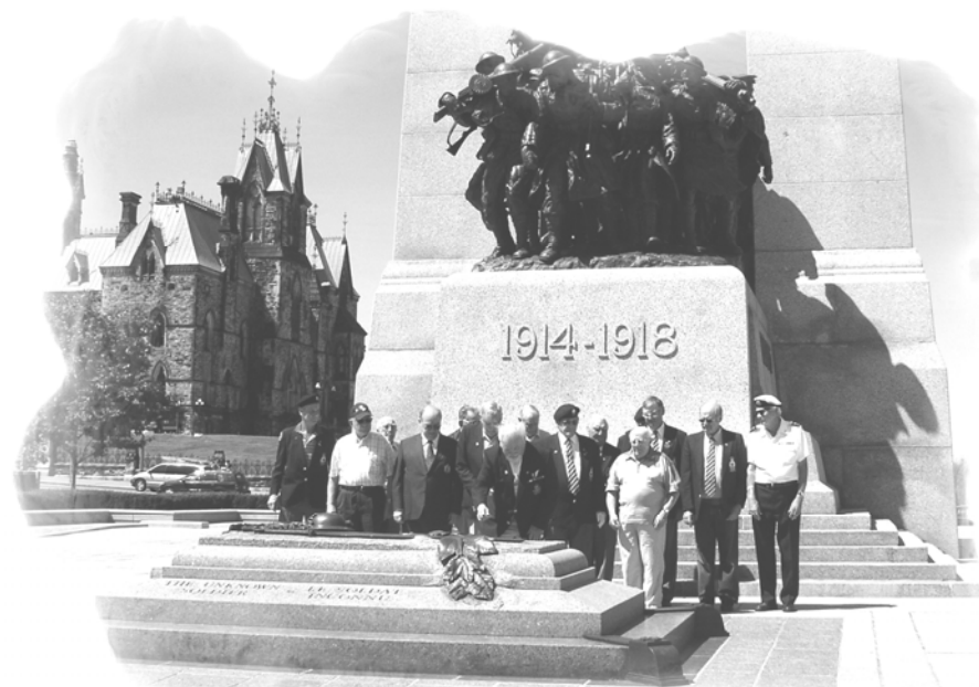
REMEMBERING THE FALLEN AUGUST 2006

They shall grow not old As we that are left grow old Age shall not weary them nor the years condemn At the going down of the sun And in the morning we will remember Them