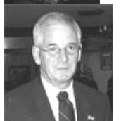
John Murphy Entertainment