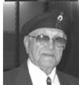
Ciem Catier Sgt at Arms