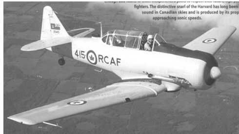
fighters. The distinctive snarl of the Harvard has long been heard in Canadian skies and is produced by its propeller approaching sonic speeds.

Go for a scenic tour in either a Harvard (below) or a Stearman Tickets $5 at the bar All proceeds go towards a Memorabilia table in the Wentworth room in honour of The 77th Wentworth Regiment Limited amount of tickets