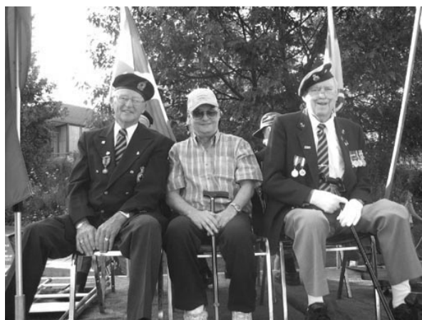
November 2004 Bullytin

Visit us online at http://www.br36dundas.com