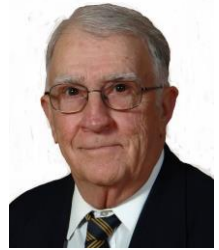
Mike Alkerton Bursary Chair